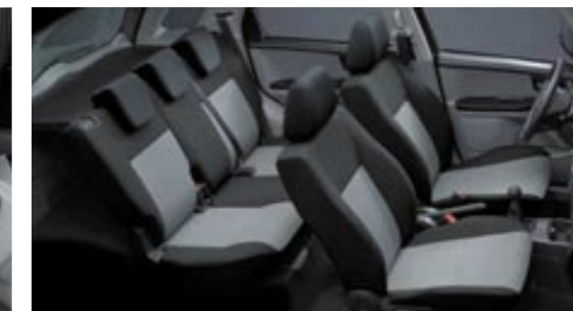
Dark gray + light gray (two-tone) interior with light gray + black fabric seats