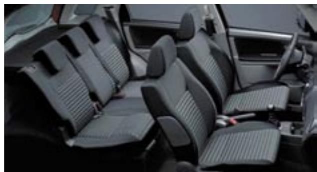
Dark gray + light gray (two-tone) interior with dark gray + black fabric seats