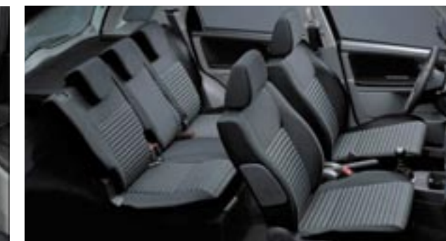
Dark gray + light gray (two-tone) interior with dark gray + black fabric seats