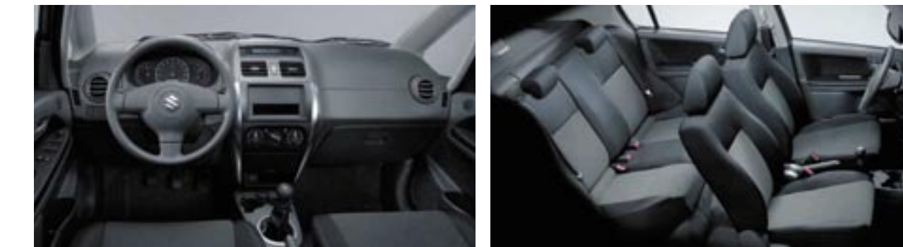
Dark gray interior with dark gray + black (two-tone) fabric seats