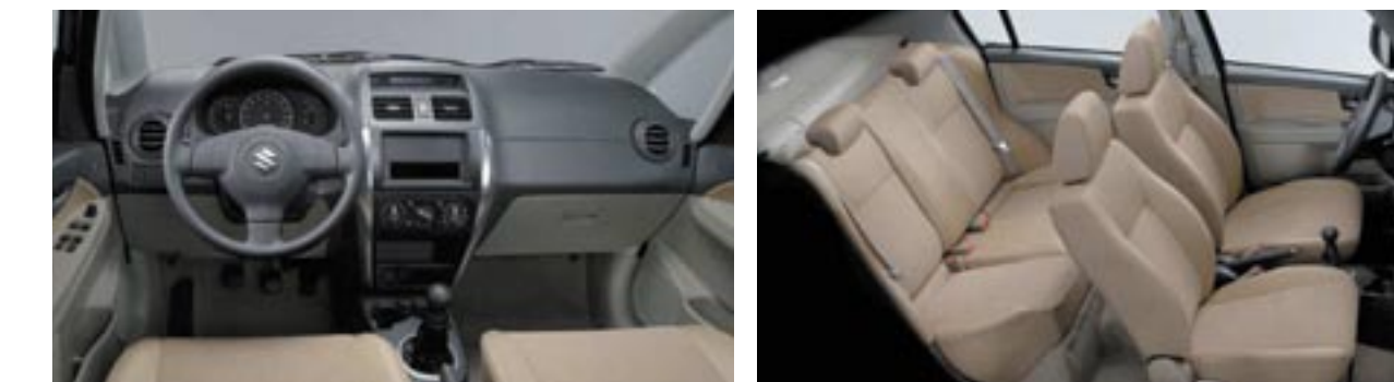
Dark gray + beige (two-tone) interior with beige fabric seats Note: The beige interior is not available for LHD models. (The picture shown is reference purpose only.)