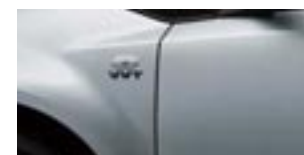
Silky Silver Metallic (Z2S)