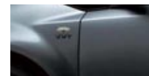
Azure Gray Metallic (ZY4)