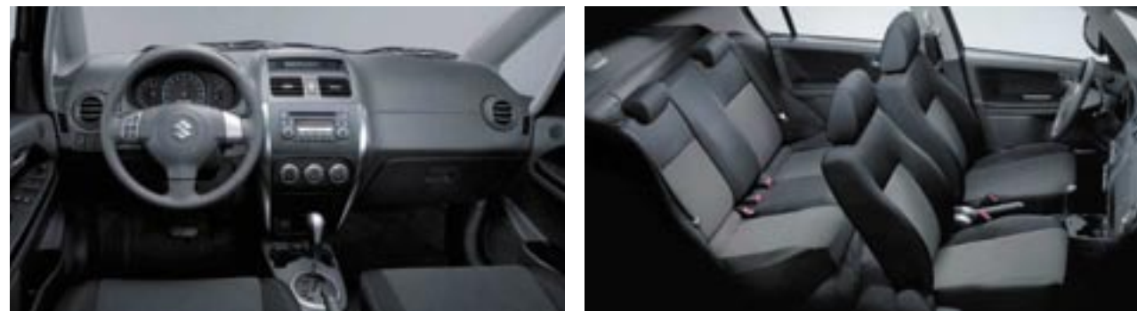
Dark gray interior with dark gray + black (two-tone) fabric seats