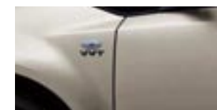
Cool Beige Metallic (ZA4)